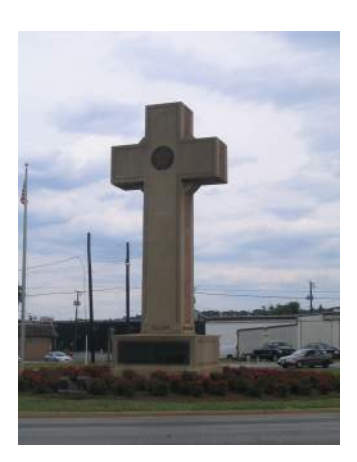
The Peace Cross, a memorial to Prince George's County soldiers lost in World War I, was erected in 1925 and listed in the National Register of Historic Places in 2015.