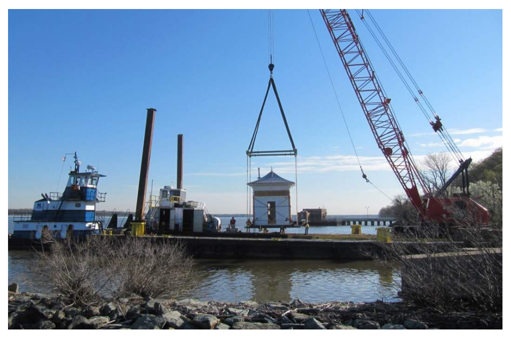
As part of an agreement through federal project review, a Watch Box prepares for a journey by barge to its original home at the Washington Navy Yard.

In 2015, the Trust reviewed over 5,600 public undertakings pursuant to federal and state historic preservation legislation to assess the effects of those projects on historic and archeological properties. Consultation resulted in over 20 formal agreement documents to resolve the adverse effects of projects on significant cultural resources and afford pertinent mitigation measures. Staff closely coordinated with program customers (including governmental agencies, local governments, business entities, consultants, interested organizations and the general public) to facilitate the successful completion of the historic preservation review process.