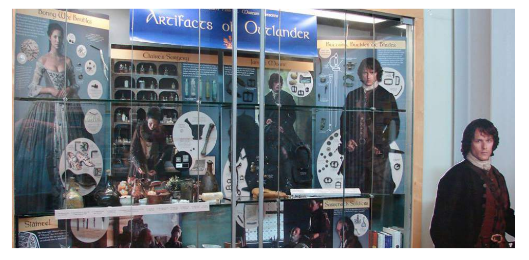
The "Artifacts of Outlander" traveling exhibit on display in the Calvert County Public Library in Prince Frederick.

JefPat's commitment to serving area schools continued through two onsite programs, one designed for fourth graders and the second aimed at students in the sixth grade. In total, more than 2,500 children participated in these two programs in 2015. Once again, staff members worked with students from Huntingtown High School on an archaeology-based project. In addition, for a second year, the JefPat education department worked with students from Mill Creek Middle School in Lusby to produce three short videos on 1812-related themes.