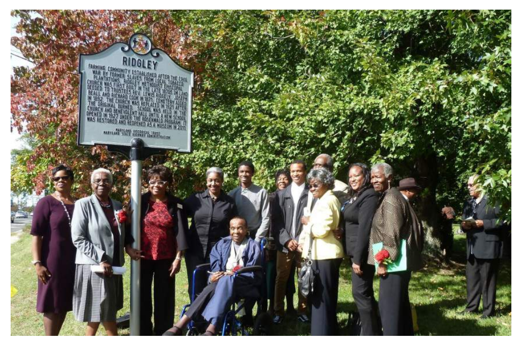
A new marker commemorates the community of Ridgley, established in Prince George's County by former slaves after the Civil War.

In 2015, Trust staff coordinated conservation maintenance for 20 outdoor bronze and stone sculptural monuments and plaques. Trust staff continued to administer the Maryland Roadside Historical Marker Program, which seeks to commemorate people, events, and places of special significance to the state through the erection of roadside markers. In 2015 five markers were installed and an additional three are on order and planned for installation by the end of 2015. These markers commemorate historical structures in five different counties and Baltimore City.