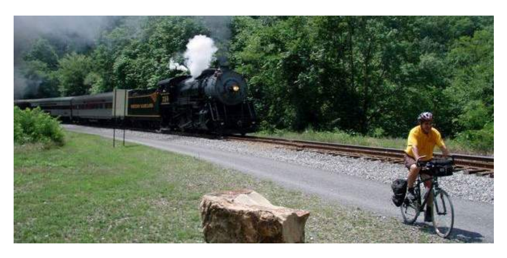
The Trail Town Program, an American Planning Association award recipient, is one of numerous projects funded by the Appalachian Regional Commission that strengthens the links between recreational trail users and local businesses.

In working with our state agency partners, this year Planning played a critical coordination role in transportation planning, working closely with staff from the Maryland Department of Transportation and local governments throughout the state. We were pleased to take part in planning the new BaltimoreLink transit plan as well as effectively ensuring that good planning practices were considered on transportation projects, such as the MD Route 28/MD Route 198 Project Study (Montgomery County) and the US Route 219 Project Study (Garrett County). These collaborations promote economic and community interests of the local jurisdictions, while also fitting into the overall statewide transportation network.