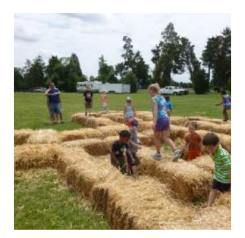
Families enjoying the hay maze at the 30th Children's Day on the Farm, June 7, 2015.