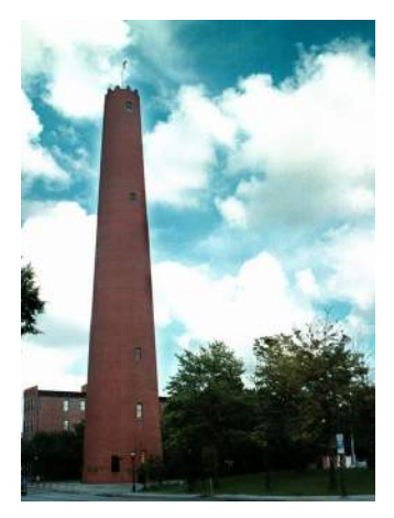
A Maryland Heritage Areas grant will improve public access to the Phoenix Shot Tower (Baltimore City), built in 1828 to manufacture lead gun shot.