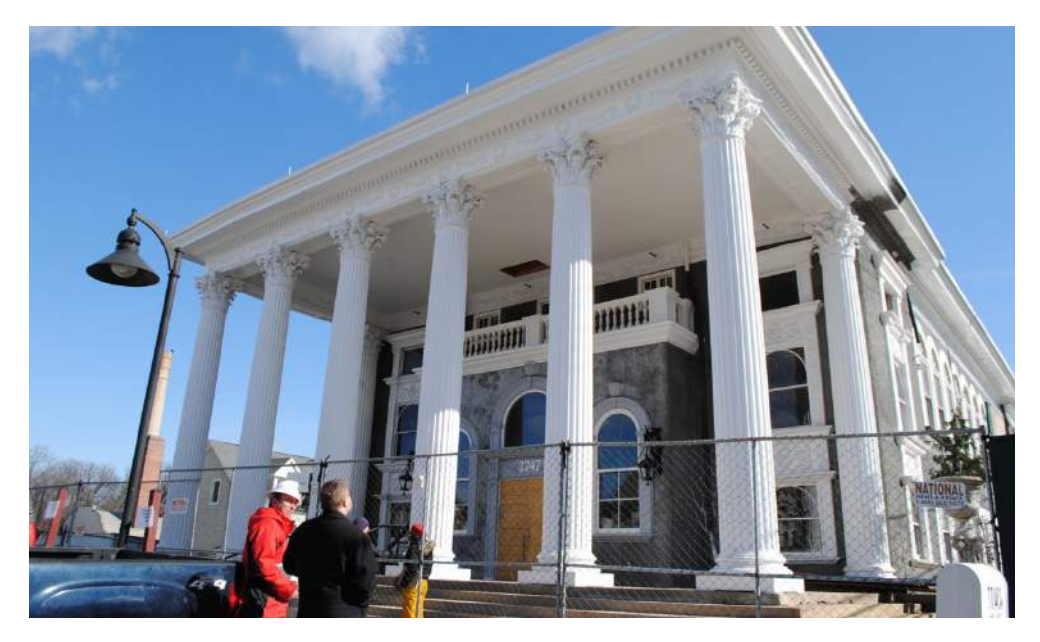
The Gymnasium at National Park Seminary in Silver Spring was recently completed with rehabilitation tax credits.