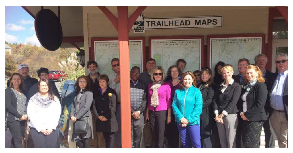
The Maryland Heritage Areas Authority meets formally every three months working on economic development through the promotion, creation and support of heritage tourism. Pictured here, the Authority and local officials observe the Garrett Trails trailhead maps while touring Garrett County Visitors Center near Deep Creek Lake.

As we strive to be a center of planning excellence, Planning continues its work supporting communities, preserving resources and enriching lives.