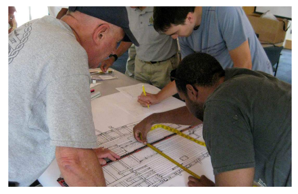
Participants attend the first year of Nautical Archaeology Society trainings hosted by the Maryland Historical Trust.

The Trust played a significant role in helping to nominate the Mallows Bay Historic District for consideration by the National Oceanic and Atmospheric Administration as the first new National Marine Sanctuary in more than 20 years. In addition to research on sites threatened by coastal erosion, program staff completed work on the site of the Ram schooner Levin J. Marvel in time for several events commemorating the 60th anniversary of its loss. The Maryland Maritime Archeology Program became an international training partner of the Nautical Archaeology Society in 2015 and has offered two courses to date, in addition to 20 outreach and education lectures and presentations on various topics statewide.