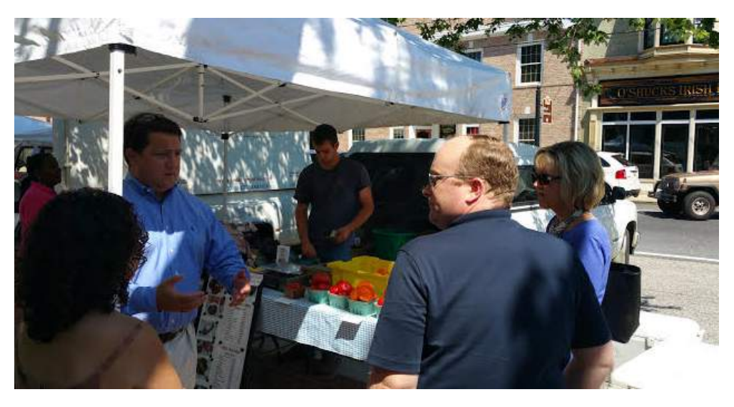
Supporting rural Maryland communities is a part of Planning's mission. We are pleased to provide the technical assistance and planning guidance that helps contribute to flourishing town centers, successful downtown business districts and thriving neighborhoods.

We continued our coordination with other state agencies, such as the Department of Commerce and Department of Housing and Community Development on legislative initiatives with a focus on promoting economic development in the state's distressed communities. In 2015 we continued to update and maintain 28 interactive mapping applications all of which provide valuable information for promoting economic development. For example, our Transit Station Area Profile Tool provides detailed snapshots of conditions around each transit station, allowing users to explore development activity and conduct in-depth research about existing conditions around every Metro and MARC station in Maryland. The Maryland Census/American Community Survey Viewer is an interactive map that provides a common platform to view Maryland Census related data. In addition, we developed five new interactive mapping applications in 2015, including one that allows users to answer real estate questions important to government decision-making and private sector investment. All of these applications are accessible to the public and our sister agencies in a free, easy to use format. Since January 1, 2015 there have been over 8,500 downloads of our digital mapping datasets.