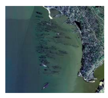
The Mallows Bay - Widewater Historic and Archeological District comprises the remains of 128 World War I steamships of the U.S. Shipping Board Emergency Fleet which were scrapped in the Potomac River between 1922 and 1945.