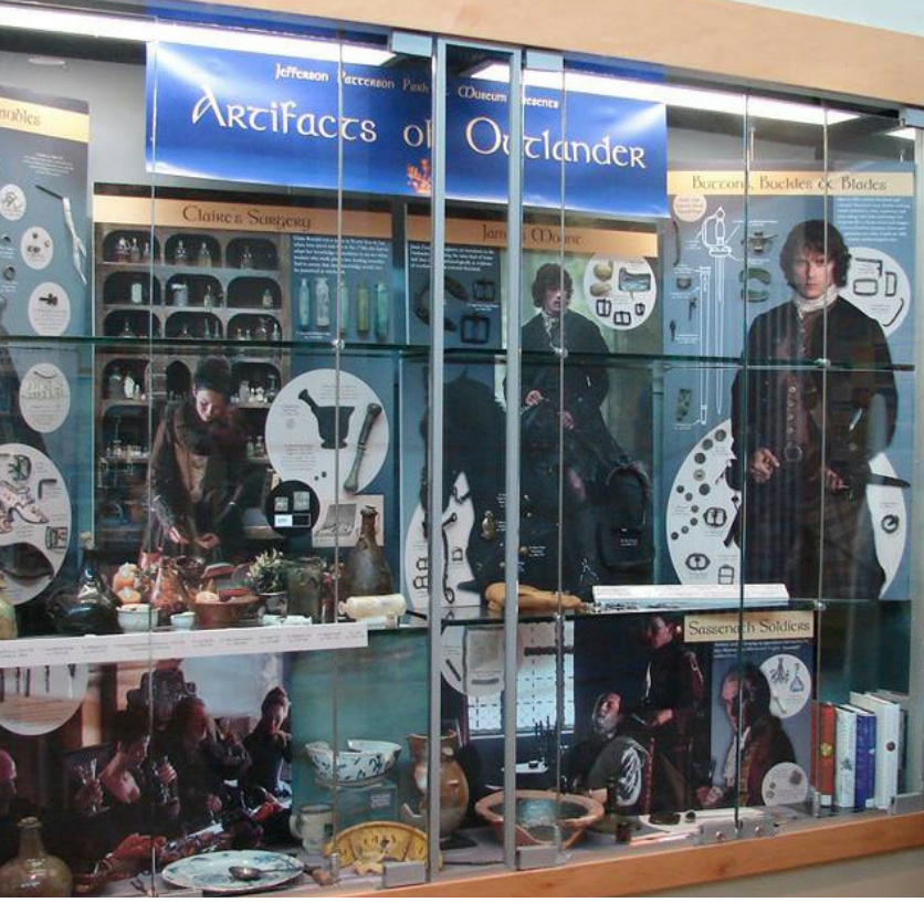
The exhibit features finds from 30 different archaeological sites in 12 Maryland counties. As an aid to visitors, a detailed exhibit catalog is offered to guide them.

The exhibit displays horse tack, drinking glasses, firearms, clothing fasteners, wig hair curlers, and rare organic survivals such as 18th-century corks and leather. Period dramas often need to take creative license with sets and costumes in order to facilitate the filming process, and while these compromises can frustrate history buffs looking for a 100% realistic depiction of the past, Maryland's artifacts prove that much of the material in Outlander is spot-on.