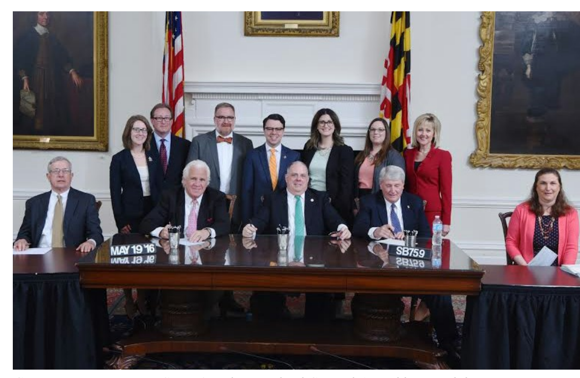
Governor Hogan signing S.B.759 – The Maryland General Assembly passed the Maryland Heritage Structure Rehab Tax Credit re-authorization, extending it for 5 years.