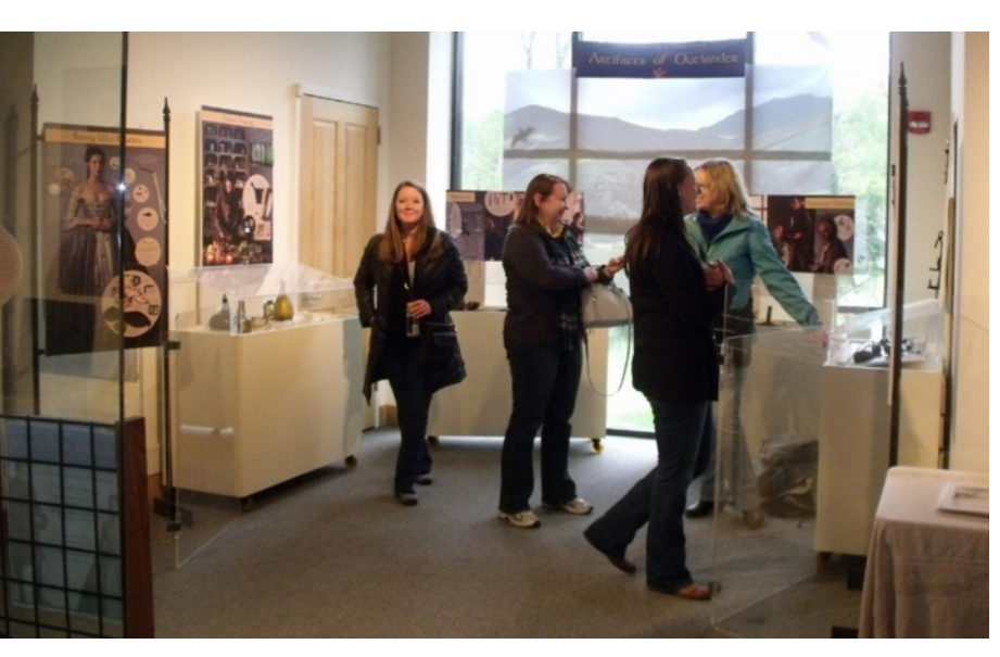
Exhibit on display during this year's Celtic Festival inside the MAC Lab's visitor center.

In August, the American Association for State and Local History (AASLH) presented the MAC Lab with an Award of Merit for the Artifacts of Outlander traveling exhibit project.