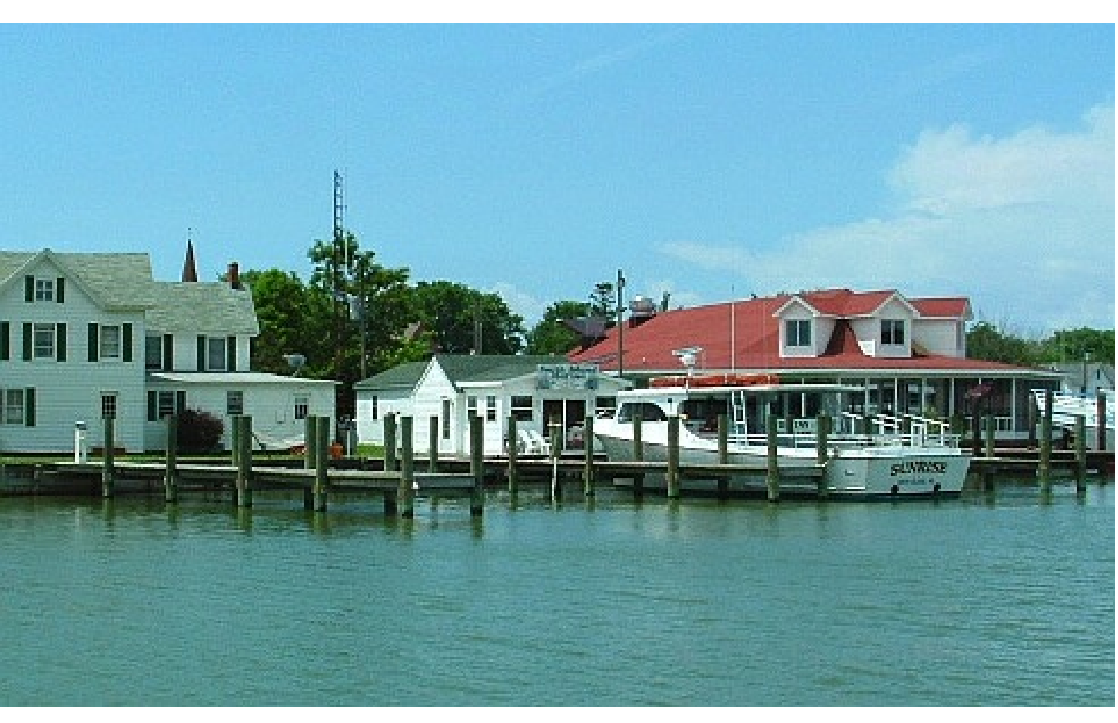
Smith Island Marina welcomes visitors to the hardworking and resilient community that has been thriving in the Southern Chesapeake since 1659.

In 2016, the Commission developed an Annual Action Plan, identified best practices for local sewage spill procedures through a watershed-wide inventory, analyzed the quality of public access points along the river, strengthened its relationship with local tourism offices to promote the Patuxent River as a Maryland amenity, identified barriers and possible solutions to implementing local river Total Maximum Daily Loads (TMDLs), held a boat trip to highlight the issue of eroding shorelines, and developed proposed travel itineraries for kayakers.