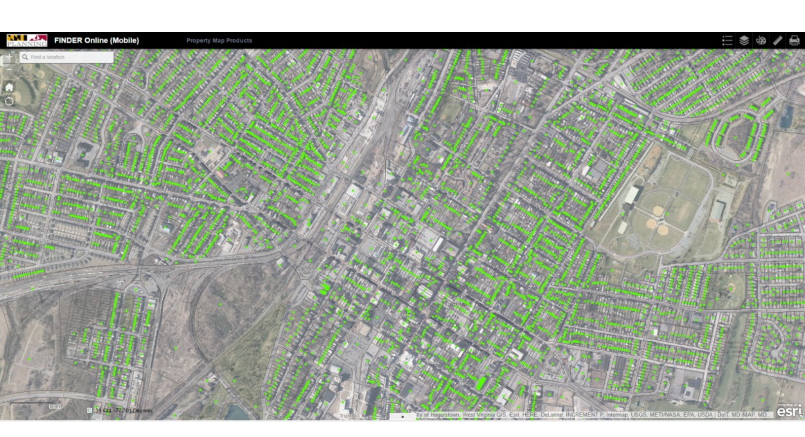
FINDER Online is one of Planning's resource tools available to the public, providing high resolution aerial imagery of property and environmental data.

Online Applications Enhancements. The unit launched an updated and improved FINDER Online web application that provides free public access to property-related information as well as other planning and environmental data viewable over high-resolution aerial imagery.