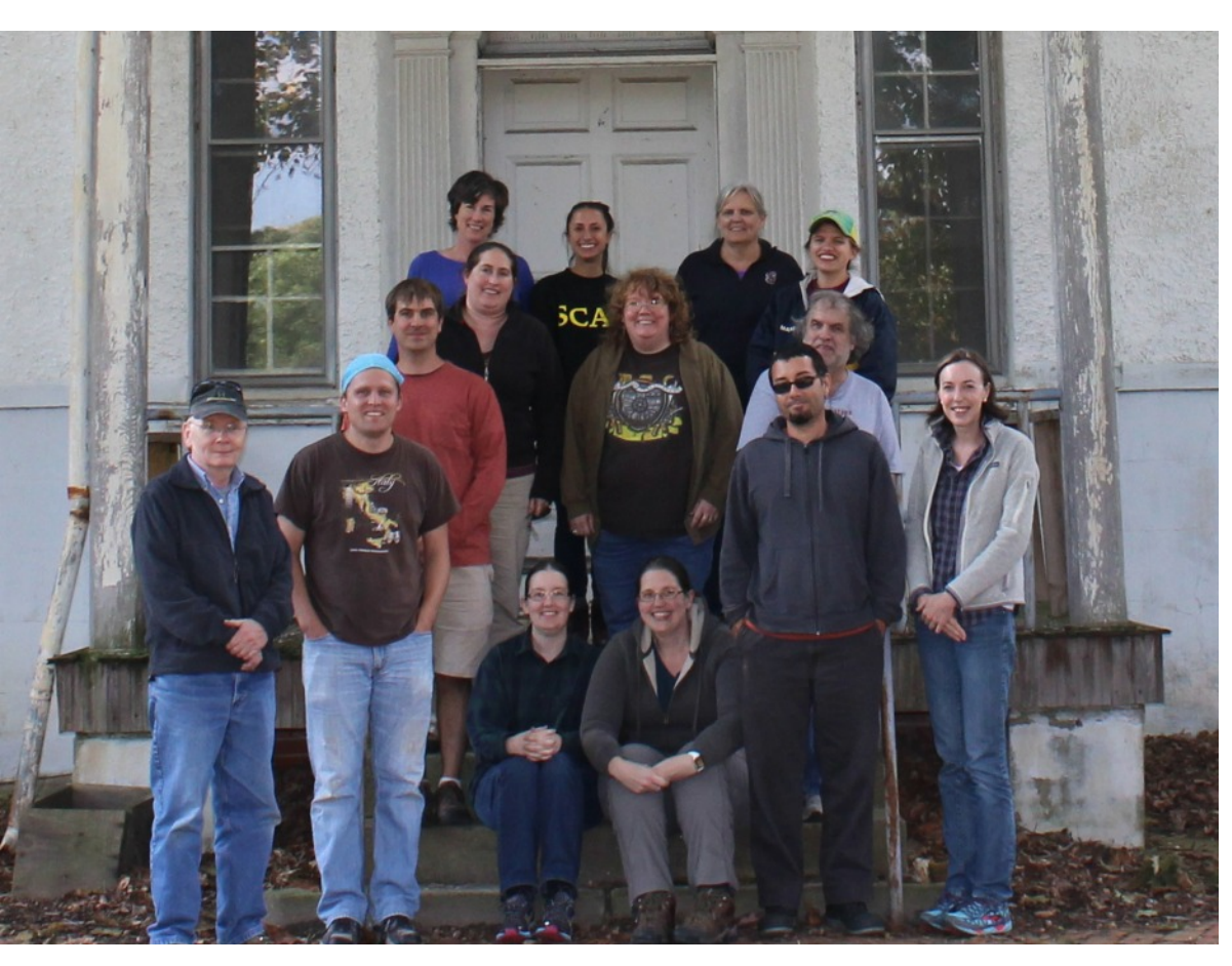
MHT staff at the second annual Orlando Ridout V Field Documentation Day at Compton Bassett.

Staff assisted eight State agencies by issuing fourteen terrestrial archeology permits in FY 2016 for investigations on lands they administer. The annual Field Session in Maryland Archeology, led and coordinated by the Trust, combines public outreach, education, and research through the investigation of a significant archeological site. In partnership with the Archeological Society of Maryland and Anne Arundel County, the 2016 Field Session focused on a prehistoric site in Anne Arundel County and involved more than 100 volunteers. The annual Maryland Archeology Month event, designed to raise awareness of the State's fragile and shared archeological heritage, focused on the 50th anniversary of the founding of Historic St. Mary's City. The archeological program at Historic St. Mary's City, with its local orientation, has been a national leader in archeological technique, research, and public outreach. A poster and informative booklet were produced and distributed to 2,000 Marylanders, and more than 40 publicly-oriented events were held across the State during the month of April.