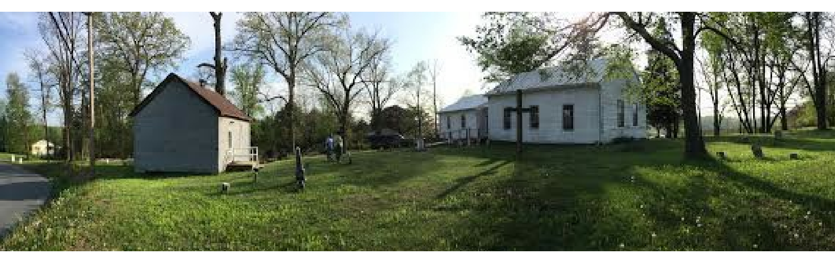
Piney Grove United Methodist Church near Reisterstown in Baltimore County will begin restoration with the assistance of a FY2016 AAHPP grant. The modest gable-front frame church was constructed in 1850; the church complex, including the community hall / schoolhouse, which predates 1872, and the cemetery, is designated as a Baltimore County landmark.

capital loans. Staff is also administering a $1.47 million grant from the National Park Service through the Hurricane Sandy Disaster Relief Fund.