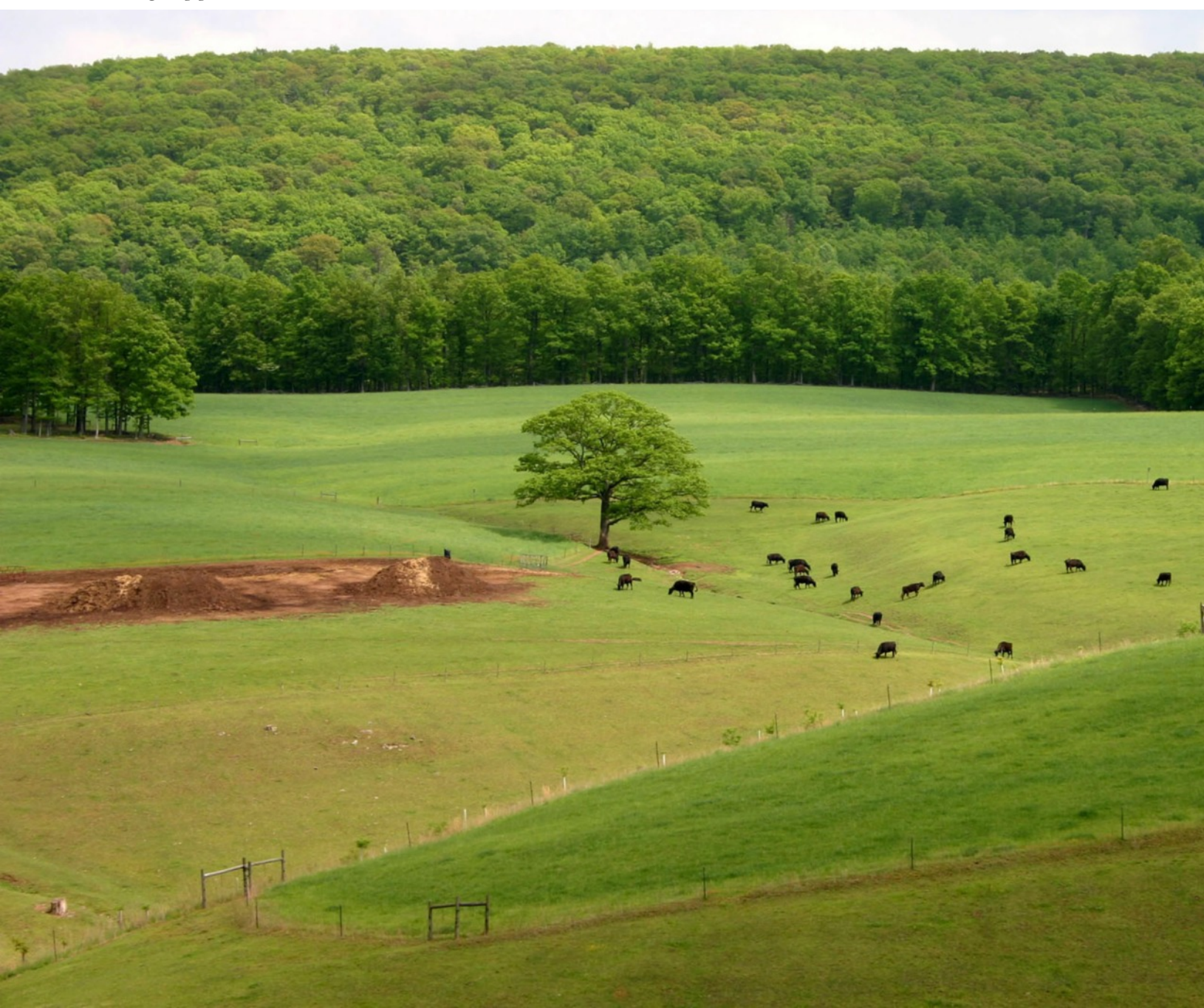
Preservation of our natural resources is one of Planning's top priorities.

We also provided GIS support for program and policy decisions by the Maryland Agricultural Land Preservation Foundation, the State Agricultural Certification Program and the Maryland Rural Legacy Program. This included development of five statistical measures for each of the twenty