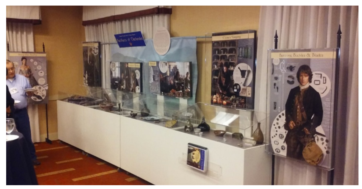
Exhibit on display in Fredericksburg, Virginia.

Those who immerse ourselves in the past for a living have good reason to celebrate this series as the lab studies and cares for the tangible remains of Maryland's colonial heritage.